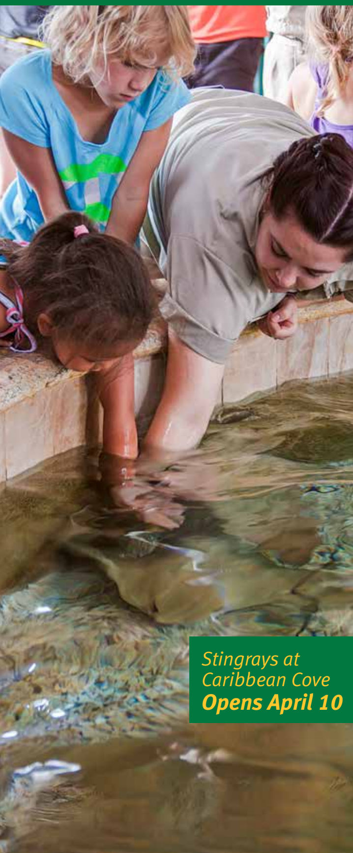
Stingrays at Caribbean Cove Opens April 10